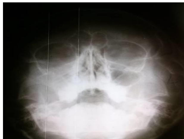
Figure 1. The plain x-ray demonstrating an opacity with a suspicious foreign body

A 12-year-old girl presented with a complaint of prolonged rhinorrhea and facial tenderness. The nasal discharge was unilateral and bloody. In her physical examination a mild fever was noted, but the nasal cavity examination did not show considerable abnormalities. She had a history of facial penetration by a pencil while playing with it about 4 weeks prior to this examination. At that time, she was examined by a young general physician in the emergency department (ED). The obtained skull X-ray was reported normal by the ED physician (Figure 1). After the initial exploration in the ED, the patient was discharged without further evaluation or radiologic studies. One month later, she returned with facial pain and tenderness in the right maxillary area in addition to nasal mucopurulent discharge.