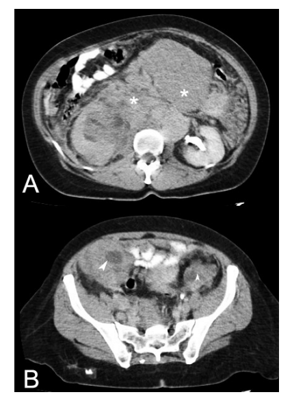
Figure 1. A. Contrast-enhanced CT Scan of the Abdomen Showing Retroperitoneal Lymph Node Enlargement (asterisks); B. Bilateral Ovarian Enlargement (arrows).

A laparotomy was performed on this patient mainly for biopsy purposes and not as a therapeutic resolution.<sup>10</sup> Even though some studies suggest that Burkitt lymphoma cannot originate on the ovary because of a lack of lymphoid tissue, it has been found that up to 54% of patients present small