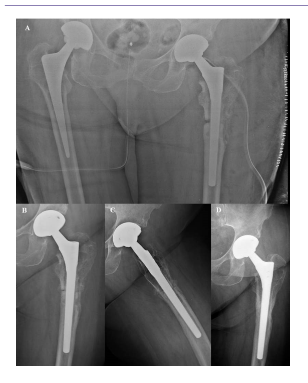
Figure 2. A tapered long stem was implanted, bypassing the fracture and obtaining a good reduction and fixation (A). After 45 days (B and C) and 3 years (D), the fracture showed progressive signs of healing and good osseointegration of the stem.

addressed the articular degeneration and would have required another surgical procedure. Thus, a cementless highly porous cup with a polyethylene insert, a metal ball and a conical long stem was implanted. A conical stem may have provided a good distal (diaphyseal) fixation, bypassing the fracture and achieving a satisfying reduction, but as reduction and fixation was brilliantly achieved by the long stem, no additional osteosynthesis was required.